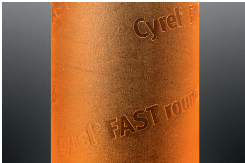
DuPont™ Cyrel® FAST round Classic