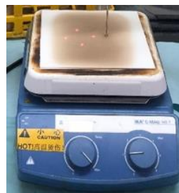
600°C Hotplate (1.2kW)