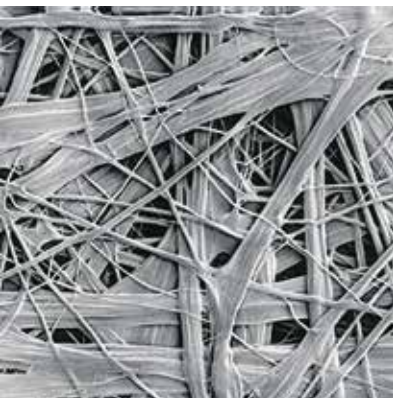
Tyvek® micro fibres offer proven durability