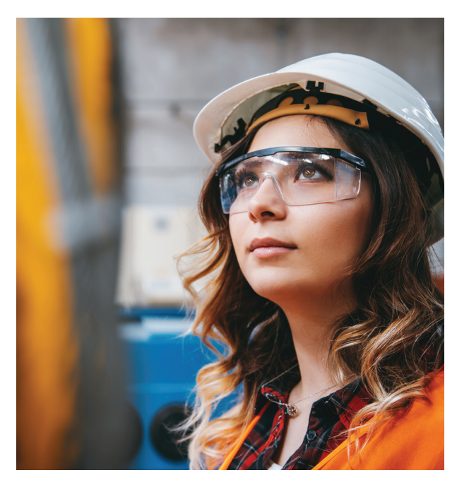
DuPont tackles some of the world's biggest challenges by creating real-world solutions that help make people's lives better, safer and healthier.

To demonstrate the company's commitment to product stewardship, DuPont has developed principles and frameworks on bioethics, biodiversity, bio persistent materials, and nanotechnology.