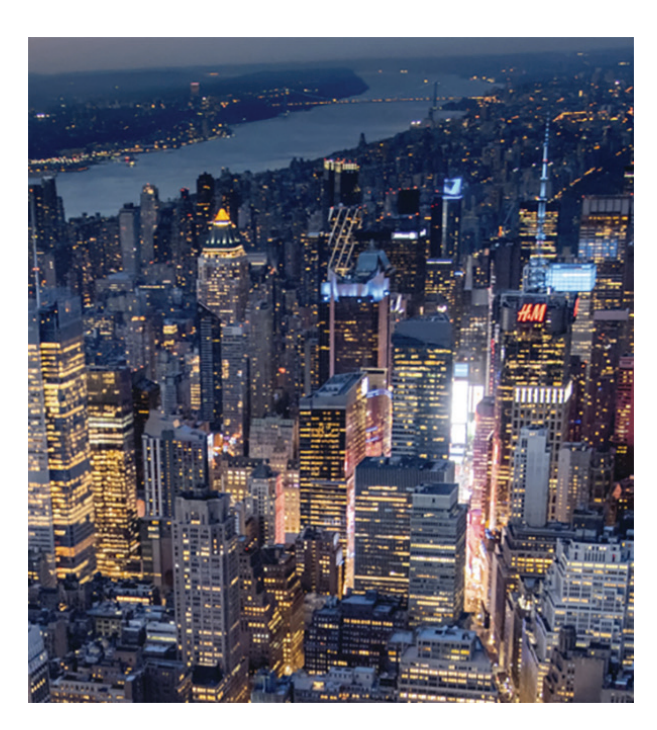
A diverse and global network of research centers, manufacturing sites and offices enable us to bring unmatched talent and expertise to our customers and partners around the world.

See also coverage of Bribes and Kickbacks.