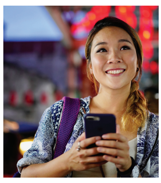
DuPont's vision has always been to apply world-class science and engineering to enable a better, safer, and healthier life for people everywhere.