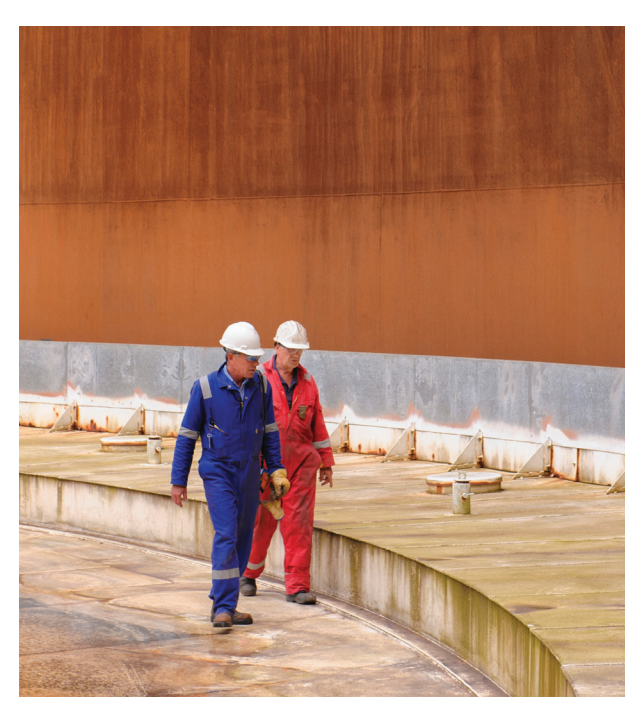
We share a personal and professional commitment to protecting the safety and health of our employees, our contractors, our customers and the people of the communities in which we operate.

• Additional information can be found in Resources on the DuPont intranet.