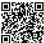
Download latest version